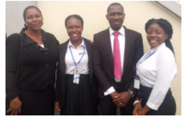
The legal team with their client upon his release.

The LCPK serves as a resource for pre-trial detainees and for the justice system as a whole, providing effective legal representation and addressing bottlenecks in Nigeria's justice system. Without this legal representation, detainees who commit petty crimes can be held in pre-trial detention for up to 10 years. Furthermore, the LCPK provides law students the opportunity to enhance their skills in criminal defense while ingraining in them the importance of public interest lawyering in Nigeria.