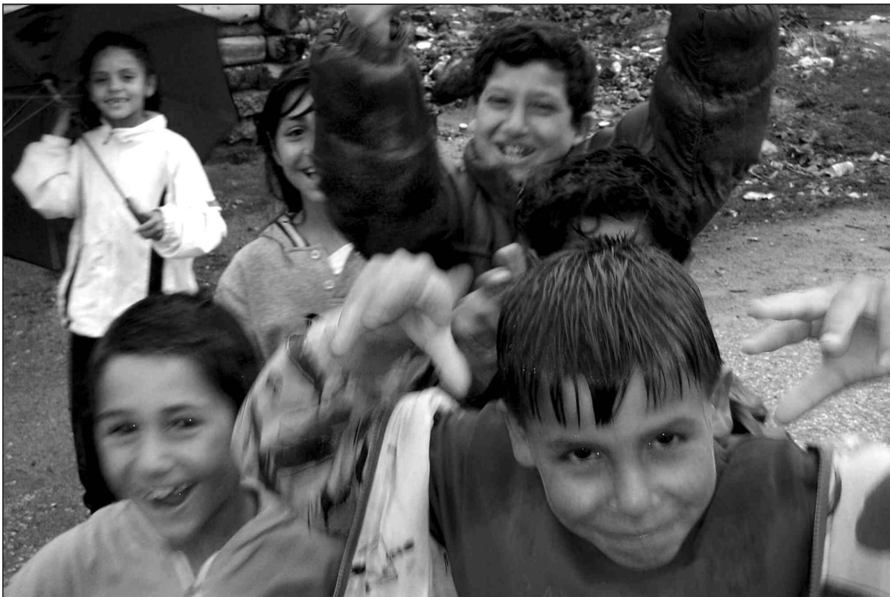
Roma children in Velká Lomnica, Slovakia.